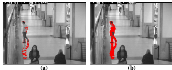
Figure 1. Detection rate and discrimination rate trade-off in chromacity based shadow detection (the original scene is shown in greyscale rather than in colour for ease of interpretation only). Red areas indicate pixels classified as being part of the person's shadow. Higher thresholds used in (a) reduce the shadow detection rate. Lower thresholds used in (b) increase the detection rate but reduce the discrimination rate.