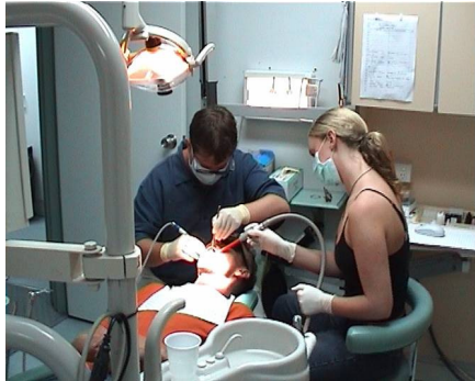
Figure 1: A dentist and assistant work together around a patient

dentistry. The dentist or assistant has to down instruments and shift their focus and posture towards the computer screen, while bringing keyboard and mouse to an orientation on a flat surface that allows them to type, select and watch the screen. They then concentrate on driving the interface by selecting menu items within a narrow range of pixels. These movements stand in stark contrast to other movements in the surgery.